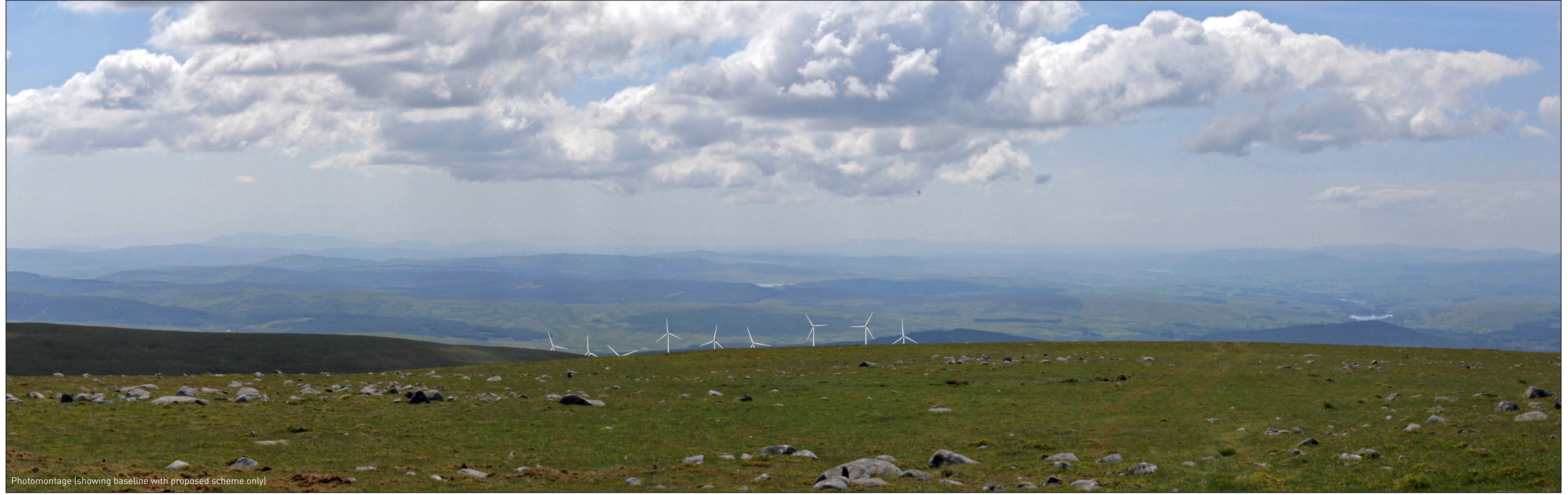
Figure 8.50 (sheet C) Viewpoint 14: Cairnsmore of Carsphairn SHEPHERDS' RIG WIND FARM